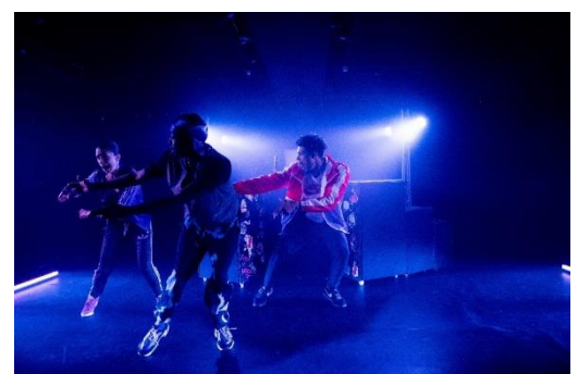
Bangers at Soho Theatre

The tour reached 619 people with lived experience of homelessness and poverty across 35 performances in hostels, community centres, youth, services and