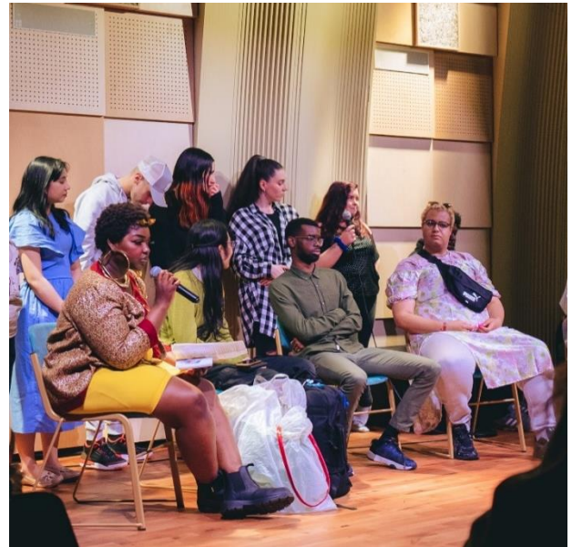
Cardboard Collective performance at World Heart Beat Embassy Gardens

Our Autumn 2022 12-week course culminated in the Collective's performance of their original songs at Rich Mix in East London and our Spring 2023 course led to a performance event at World Heart Beat Embassy Gardens in May. Click here to see a video from the Rich Mix performance in December 2022.